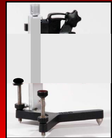
Trivet with Handle