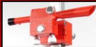
Alignment Transit ($500 credit)